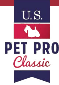
EXHIBIT SPACE CONTRACT

1. APPLICATION and CONTRACT for exhibit space at THE U.S. PET PRO CLASSIC 2023 to be held at the Irving Convention Center at Las Colinas on October 6-9, 2023. ALL APPLICATIONS MUST BE SUBMITTED ELECTRONICALLY. APPLY HERE , or email this contract to info@uspetproclassic.com . Upon approval a representative will contact you for payment. PAYMENT IN FULL IS DUE UPON APPROVAL.